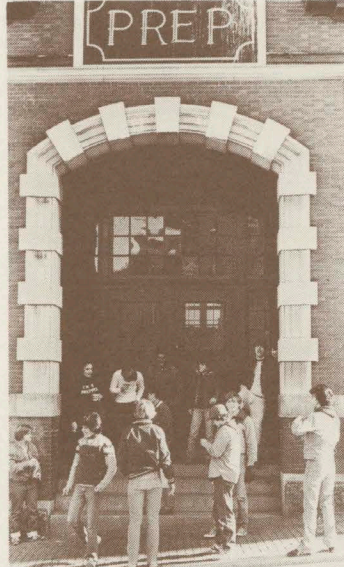
The other students at PREP are the best part of the day.