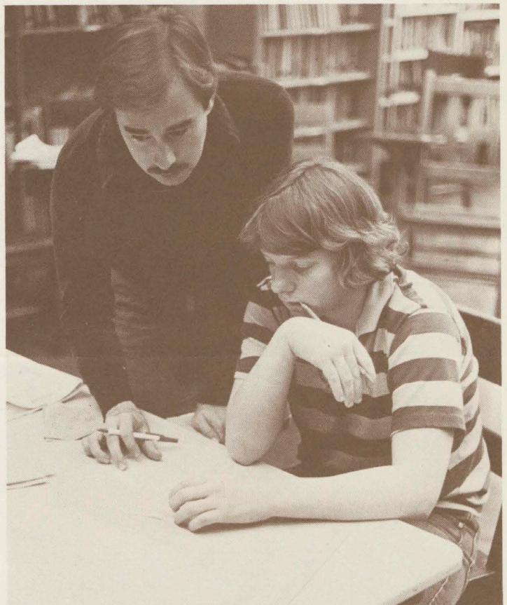
Why do I go to school? I go to school because I like it.