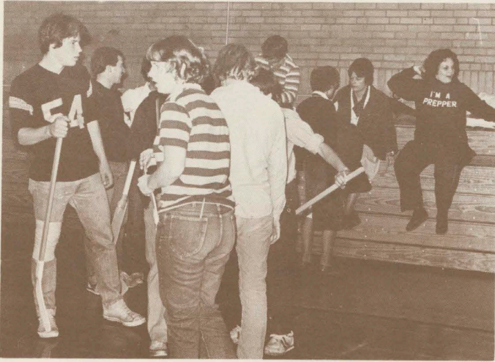
SAC is the best time during the school day