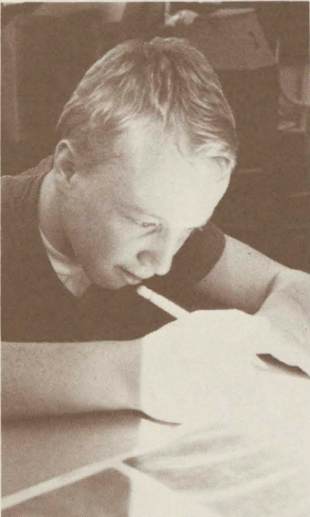
What I like best about school is Reading, I couldn't do it before.