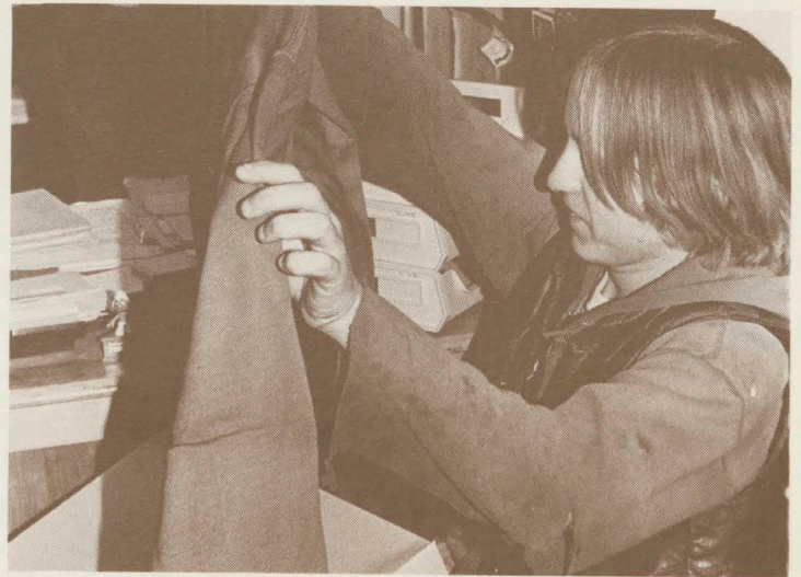
What I like best about school is auctions